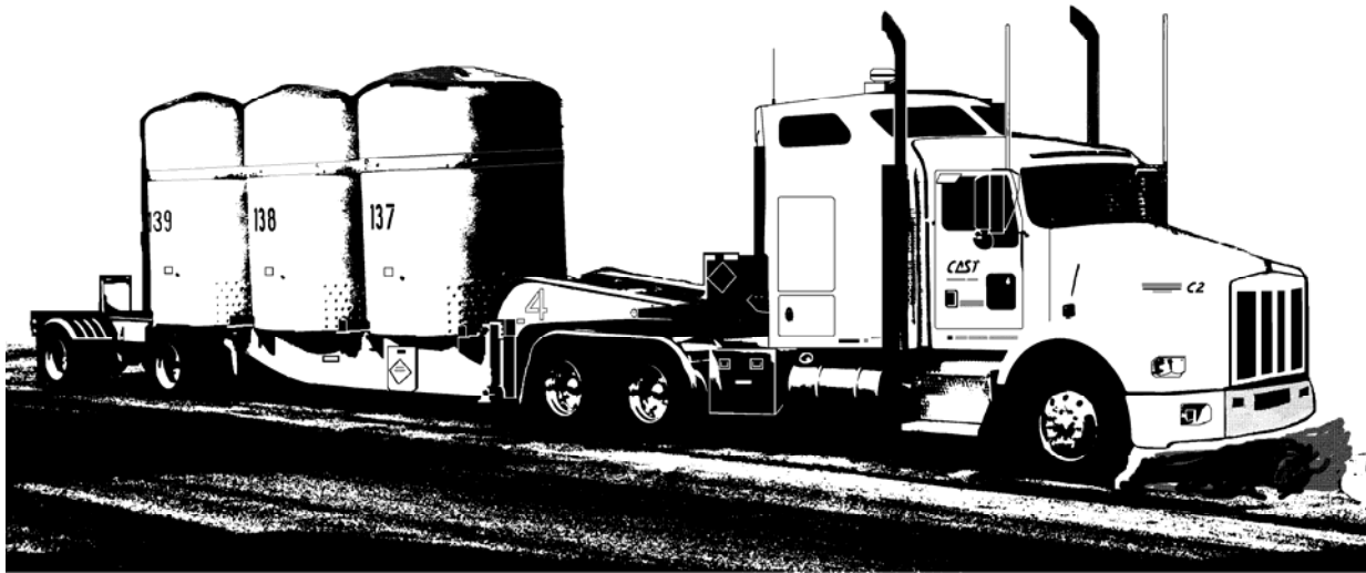
Figure 2 Cutaway of TRUPACT II Container