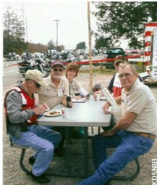
N5MME, KD5NIC, KD5NIB, KC0EHR, WB5DCU at Loose Wheels, Sherman Texas

Grayson County amateur radio operators assisted with communications for this fund raiser event.