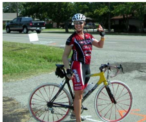
Van Alstyne Rest Stop