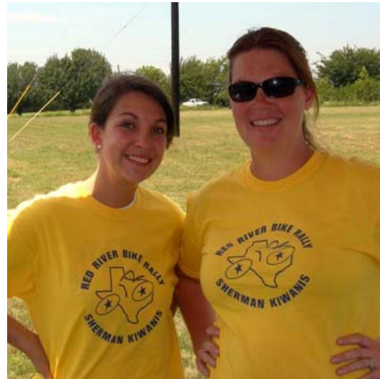
Luella Rest Stop – Kiwanis Staff