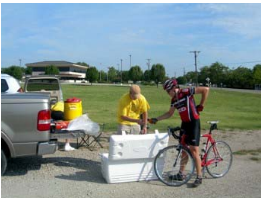
Van Alstyne Rest Stop