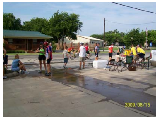
TomBean Rest Stop