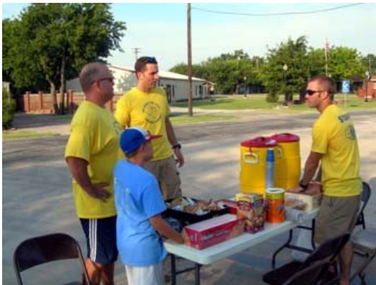
TomBean Rest Stop