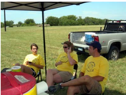
Luella Rest Stop – Kiwanis Staff