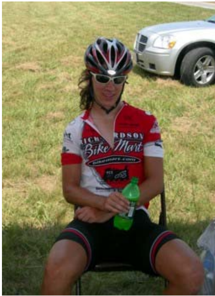
Luella Rest Stop