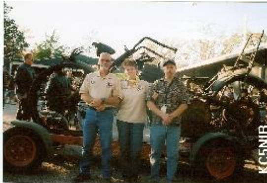
KD5NIC, KD5NIB, KD5ZPI