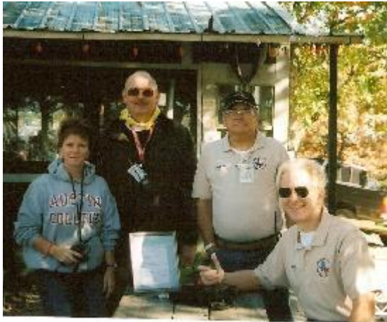
KD5NIB, KC0EHR, WB5DCU, KI5DQ

Several area amateur radio operators provided communications during this event. This fund raiser was choreographed by the Sherman Red Cross along with several local sponsors and private individuals. The fund raiser rally started / ended at Loose Wheels http://www.loosewheelstexas.com . Commutations were provided from a net control station located at the event finish line which simultaneously interfaced the event staff to all three rest stops, and support vehicles.