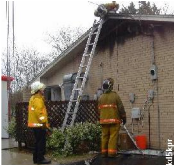
Photo to the right - Denison Fire Department looking at the Red Cross Building, Lower left photo – damaged antenna feedlines inside the Red Cross Building, Lower Right photo – damaged antenna feedline on radio tower leg (complete blowout).

Just before noon on March 18, 2006, The Red Cross office building was struck by lightning. Observant neighbors immediately contacted the Denison Fire Department. The building caught fire on the west eve of the roofline. The radio tower besides the building contains amateur and business band antennas. While the antennas appear to be OK, one feedline was badly burned.